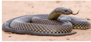
Year 5 King Browns