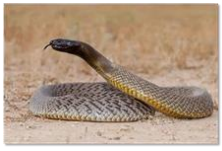
Year 5 Taipans